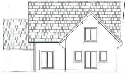
South elevation 1:100

Scottish Borders Council Town & Country Planning (Scotland) Act APPROVED (Subject to conditions) - 8 FEB 2007 Planning & Economic Development Department