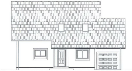
North elevation 1:100